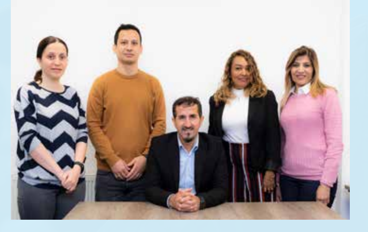
The WRC Move On team

2,232 face-to-face sessions 4,623 telephone and email follow ups 218 referrals to partner services